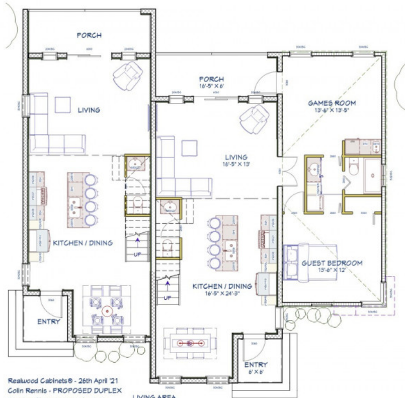
Realwood Cabinets® - 26th April '21 Colin Rennis - PROPOSED DUPLEX Passion Circle Lookout Gardens, Bodden Town, Grand Cayman